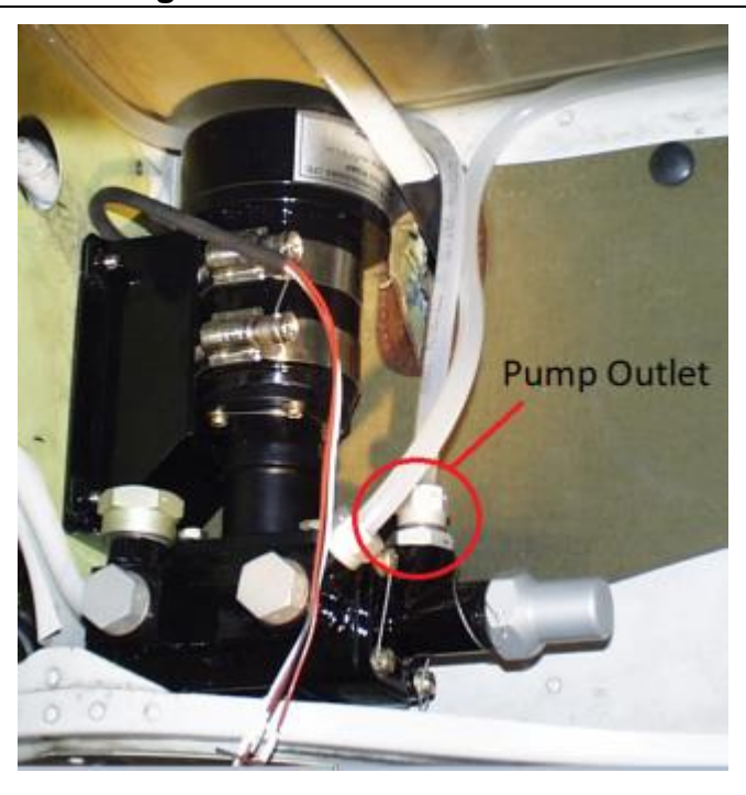
Figure 2: Pump Outlet Location

(2) Using the following items and manual 30-09-46, assemble a line to attach to the outlet of the pump.