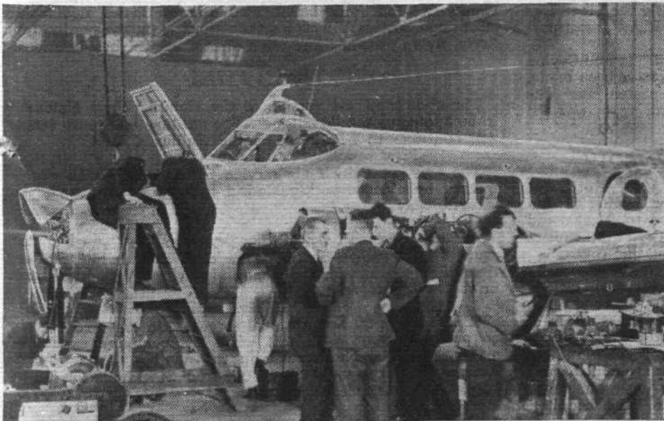
BIRD OF PEACE: Technicians busy on the second prototype of the de Havilland Dove. The plastic dome on the cockpit covering houses the D.F. aerial.